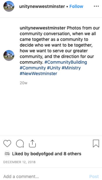
Our event is tracked on instagram...