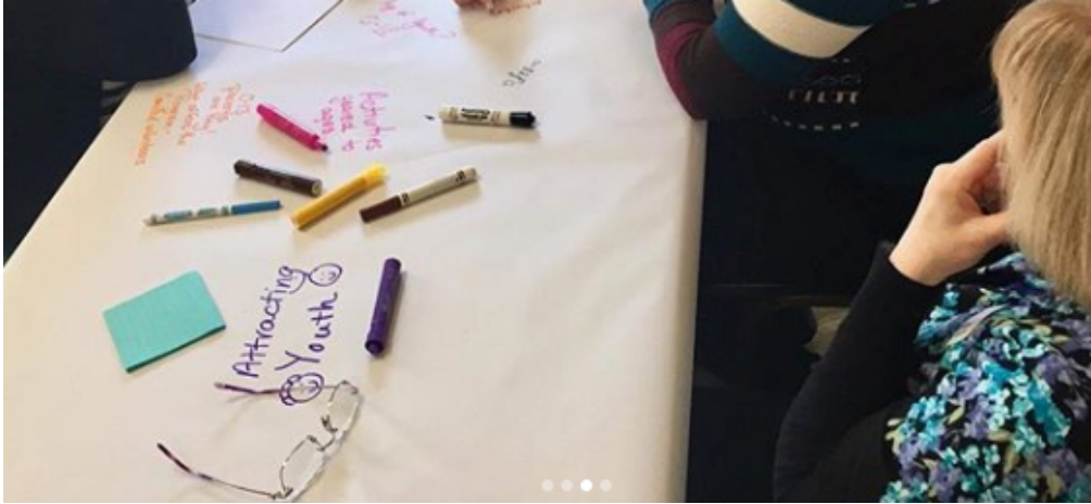
Congregation members come together to generate ideas.